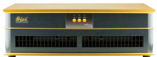
Ojas Eco Bionizer Pro Gold