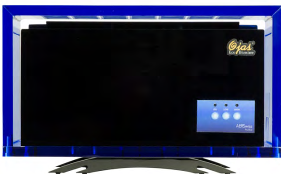
Ojas Eco Bionizer Pro Blue

The Ojas EcoBionizer AERSwiss Pro units do not generate ozone, and maintain a consistent level of bipolar ionization in the air.